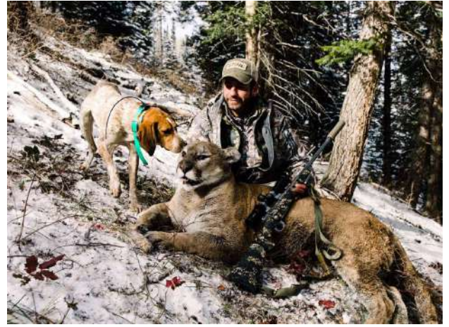
Joe Monchelli © Joe Monchelli