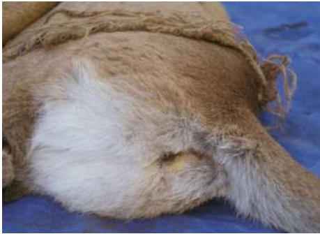
Female mountain lion hindquarters

Beneath the scrotum is a small, conspicuous black spot (about 1 inch across) that surrounds the penis sheath opening.