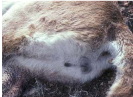
Male mountain lion hindquarters

FEMALES have only two spots below the base of their tail, including the anal opening hidden beneath the base of the tail and vaginal opening directly below the anus. The rest of the area behind the female's hindquarters is covered with white fur.